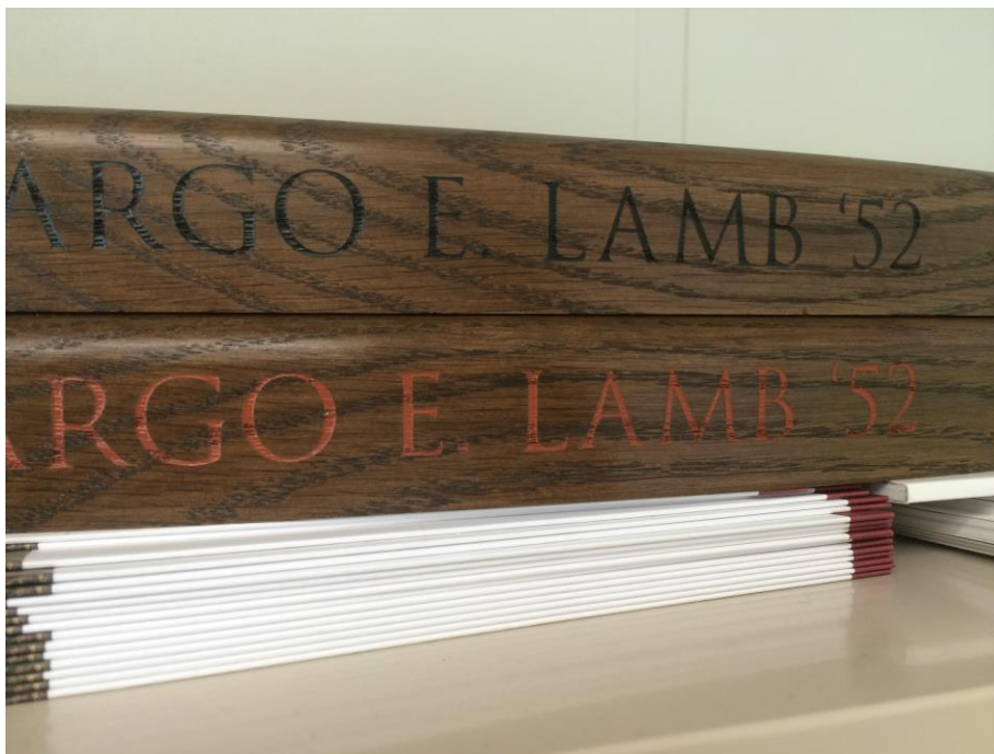
Table Engraving Sample