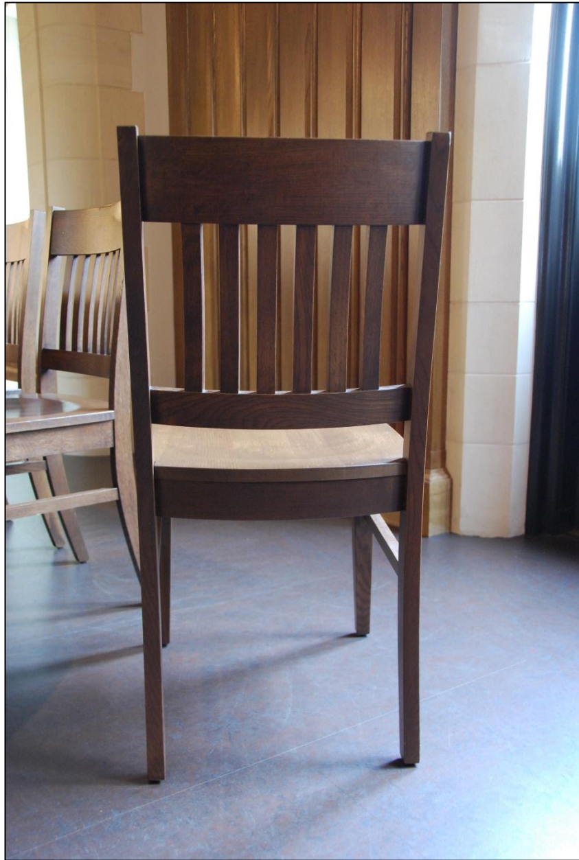
Chair in Great Hall: $50,000